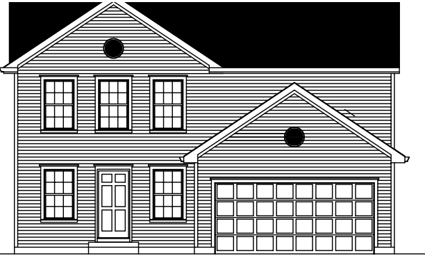
Front Elevation - Option A

With traditional features, the Sycamore is a great value. Three bedrooms, two and a half bathrooms and a full basement compliment this plan. With a host of options, this plan can easily meet your needs.