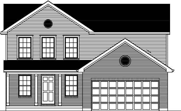
Front Elevation - Option B